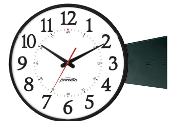
Easy-to-assemble bracket kit lets you create a dual-sided clock for hallways or other large areas.