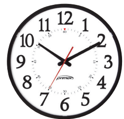
12.5" or 16" Traditional Series