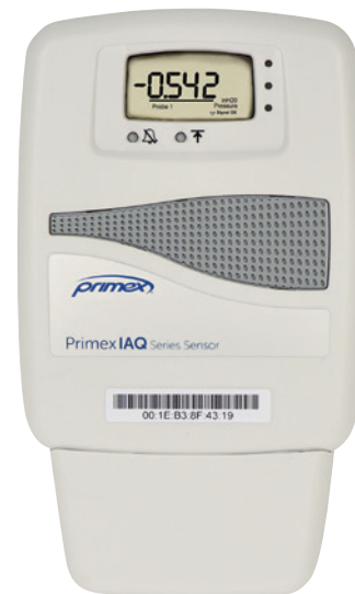
PrimexIAQ Series Differential Pressure Sensor